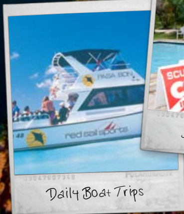
Daily Boat Trips